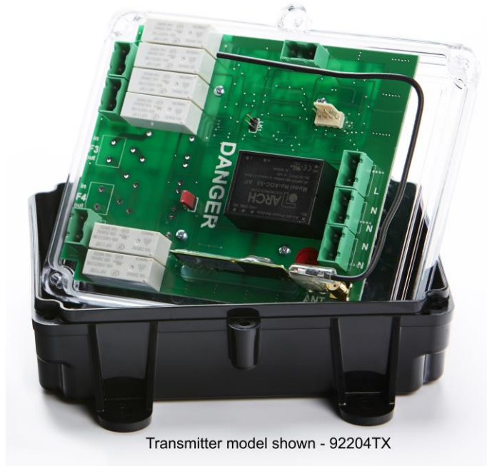
Transmitter model shown - 92204TX