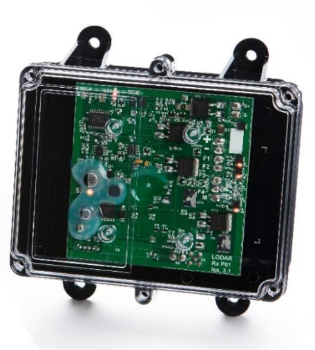
Transmitter model shown - 92S06TX